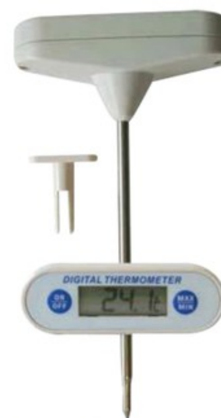
THE0003 THERMOMETER DIGITAL T-BAR (-50°C + 200°C) STRONG PROBE THERMOMETER