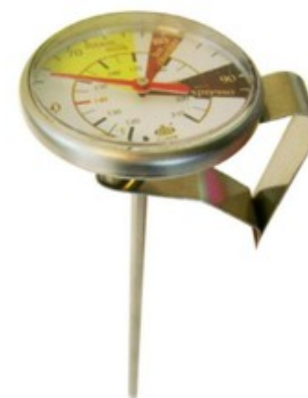
THE0008 THERMOMETER COFFEE 125mm (50°C to 100°C) COFFEE, CAPPUCCINO, MILK THERMOMETER