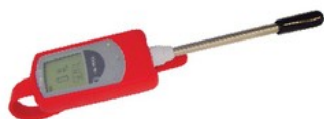
OTE0001 OIL TESTER ELECTRONIC