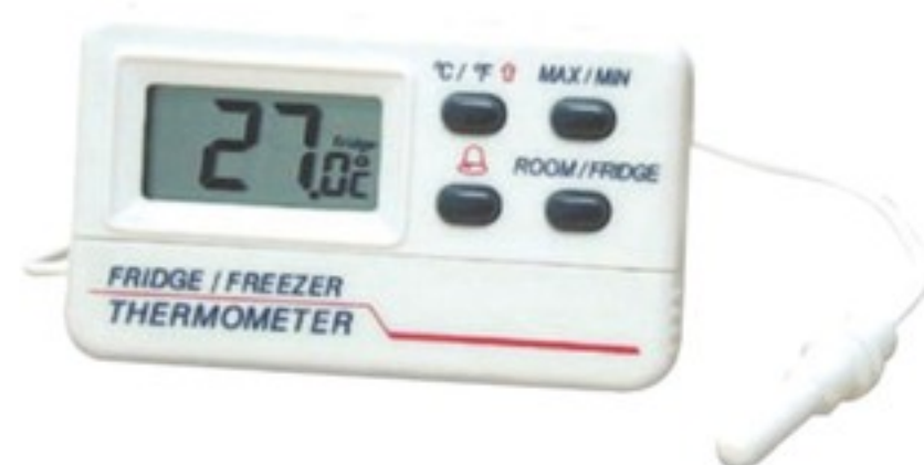
THE0005 THERMOMETER DIGITAL FRIDGE/FREEZER -50°C to 70°C FRIDGE / FREEZER THERMOMETER