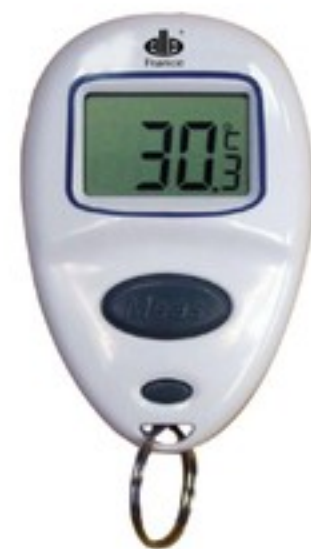
THI0002 THERMOMETER MINI INFRA RED -50°C to +300°C