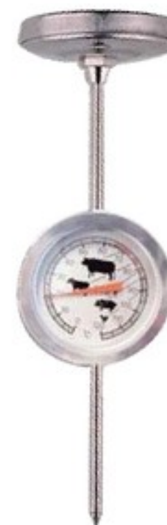
THR0140 THERMOMETER ROASTING STEEL STEM 140mm 0°C to 120°C COOKING THERMOMETER