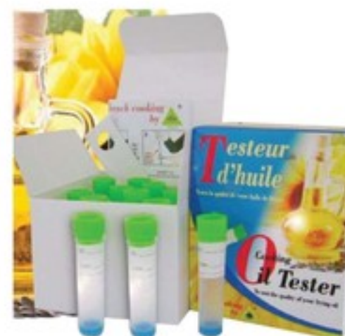
OTK0010 OIL TESTER KIT - PACK OF 10