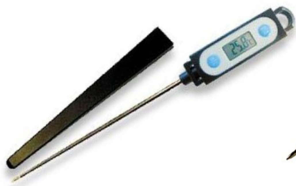
THE0120 THERMOMETER ELECTRONIC 120mm (-50°C to +200°C) WATER RESISTANT THERMOLAB THERMOMETER