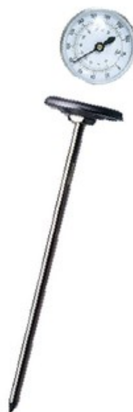
THP0130 THERMOMETER POCKET DIAL 130mm (0°C to 120°C) KEEP IN POCKET TO TEST TEMPERATURES