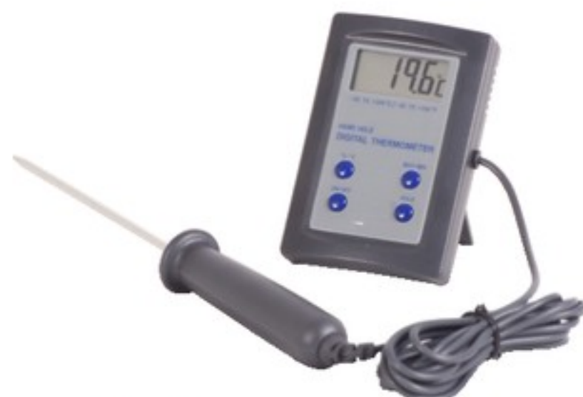
THE0006 THERMOMETER DIGITAL + TIMER -50°C to 200°C RECALIBRATABLE COOKING THERMOMETER