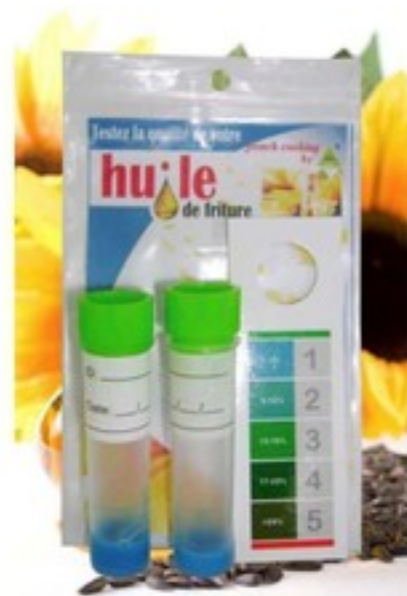
OTK0002 OIL TESTER KIT - 2 PACK FOR TRAIL