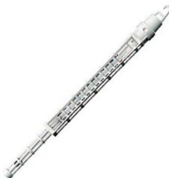
THE0007 THERMOMETER CANDY - PLASTIC SLEEVE WITHOUT MERCURY INTERNAL SCALE GLASS THERMOMETER