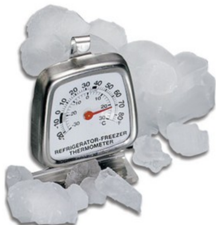
THF0001 THERMOMETER FRIDGE / FREEZER -30°C to +30°C - S/STEEL THERMOMETER