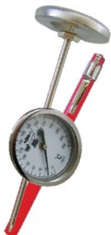
THF0130 THERMOMETER DEEP FRYING 130mm (0°C to 300°C) USE IN POTS, DEEP FAT FRYERS