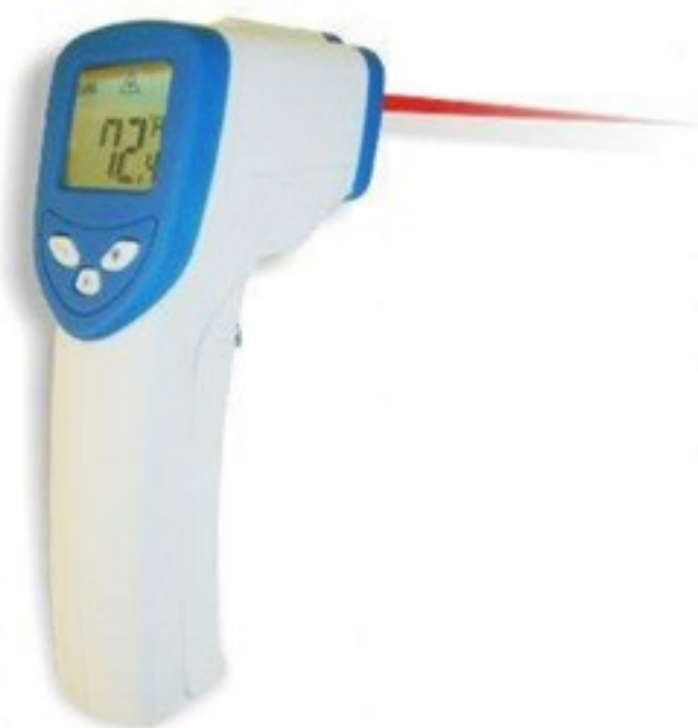
THI0001 THERMOMETER INFRARED LASER -50°C to +530°C