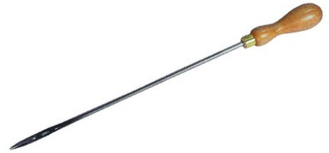
RBN0300 ROLL BEEF NEEDLE - 300mm (LENGTH OF NEEDLE)