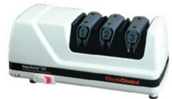
EKS0120 ELECTRIC KNIFE SHARPENER CHEF'S CHOICE