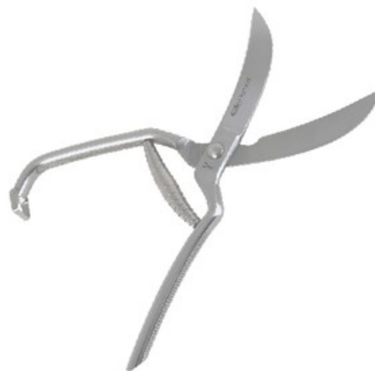
PSG0002 PORK SHEARS GRUNTER - 280mm