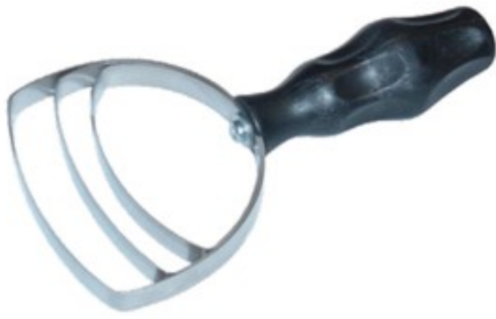
MSN0002 MEAT SCRAPER S/STEEL - 170mm