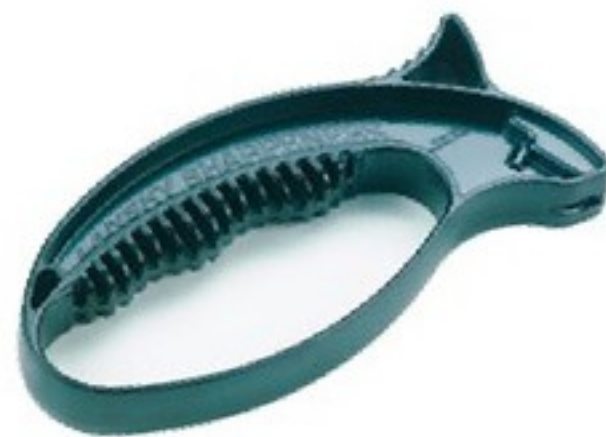
KSH0001 KNIFE SHARPENER - HAND HELD - LANSKY