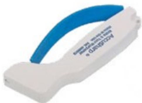
KSH0002 KNIFE SHARPENER - HAND HELD (ACCUSHARP)