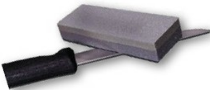
SSK0001 SHARPENING STONE 50 x 150 x 25mm (WATER BASE)