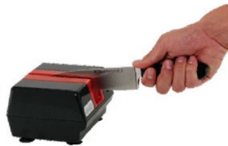
EKS0001 ELECTRIC KNIFE SHARPENER