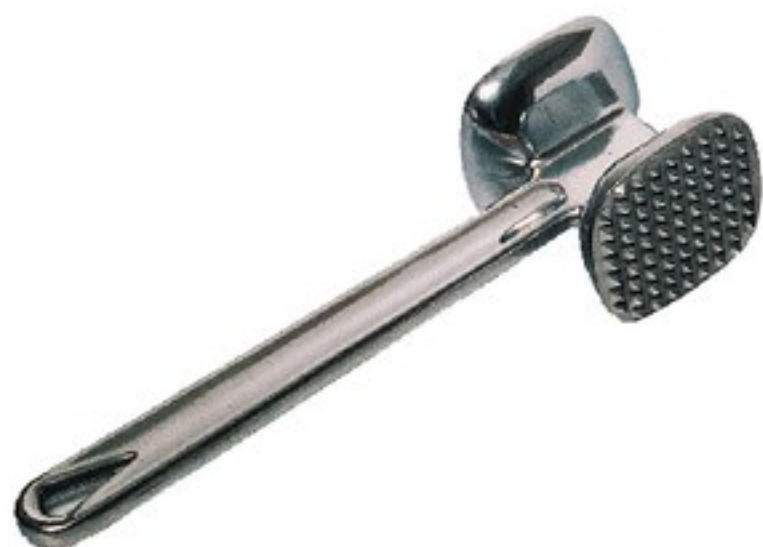
MMH0002 MEAT Mallet HAND 250mm (ALUMINIUM)