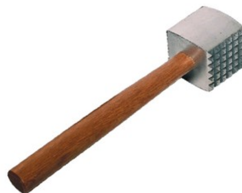
MMH0001 MEAT Mallet HAND - 300mm (WOODEN HANDLE)