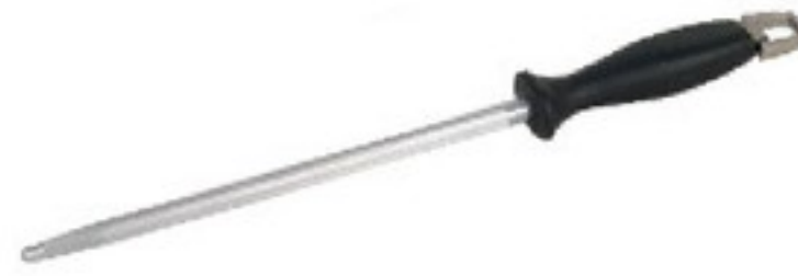
SSM0350 SHARPENING STEEL GRUNTER - 350mm