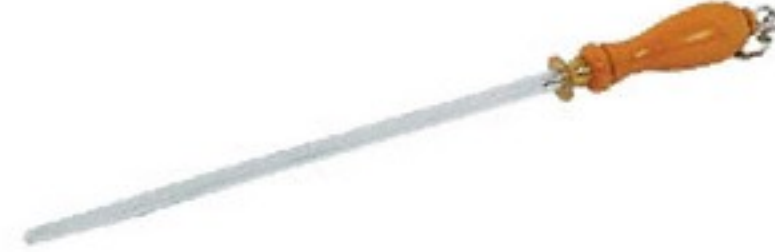
SSE0350 SHARPENING STEEL EGGINGTON - 350mm