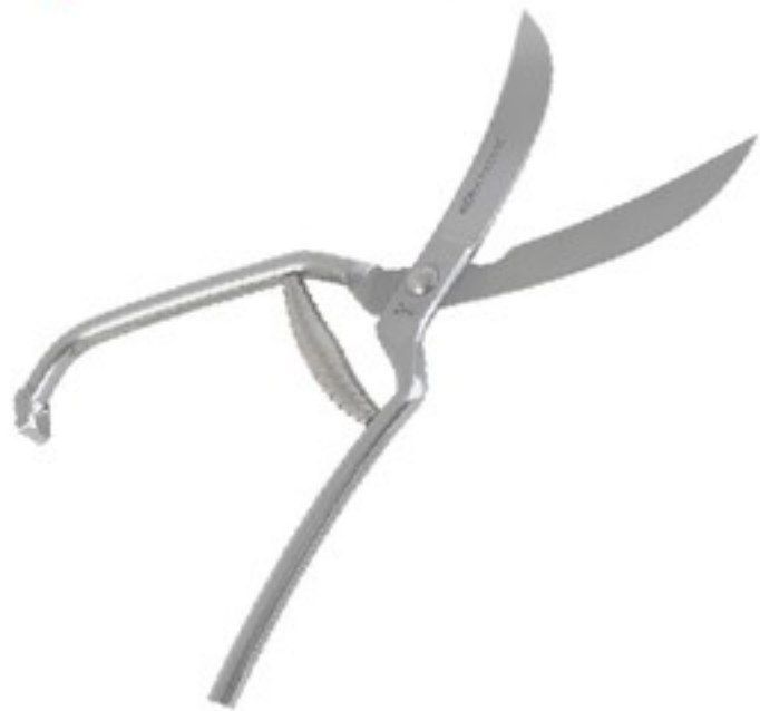
PSG0001 POULTRY SHEARS GRUNTER - 265mm