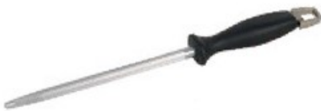
SSM0300 SHARPENING STEEL GRUNTER - 300mm